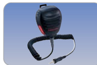
CMP460 Waterproof Speaker/Microphone