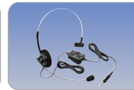
VC-24 VOX Headset