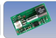
FVP-31 Encryption Unit