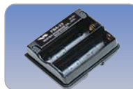
FBA-23 Alkaline Battery Case