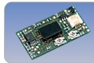
SU-1 Barometric Pressure Sensor Unit