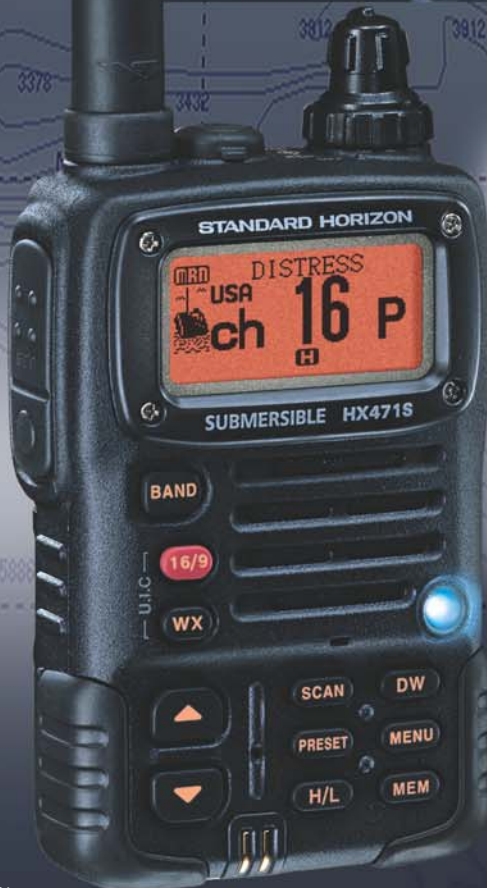
Actual Size *Simulated LCD display