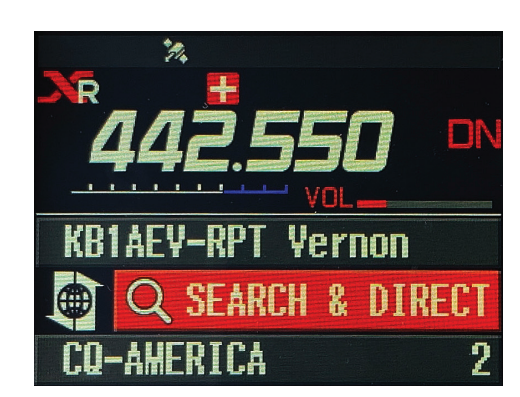
Figure 4 — The Yaesu FTM-500DR connected to the WIRES-X network repeater node.

Through WIRES-X you can enjoy conversations with amateurs all around the world, using the internet as a bridge to pass audio data and other information back and forth. Accessing the WIRES-X network is remark-