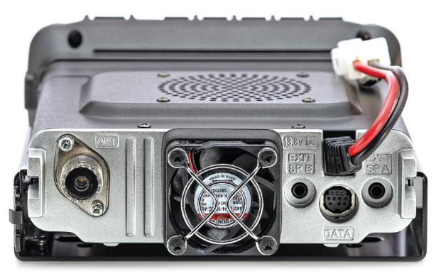
Figure 3 — The Yaesu FTM-500DR rear panel.

Yaesu has included the Group Monitor feature in the FTM-500DR. While its use is limited to communicating with other Yaesu C4FM transceivers, it has the potential to be quite handy.