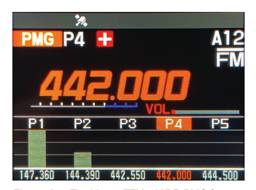
Figure 1 — The Yaesu FTM-500DR PMG feature.

Another E2O-IV enhancement is the Customized Function List (CFL). As with any feature-rich radio, there are some functions you'll use frequently, but others you'll rarely use at all. CFL allows you to create