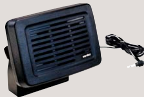
MLS-100 High-Power External Speaker