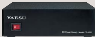
FP-1023 (U.S.A. only) AC Power Supply (23 A) FP-1025A (U.S.A. only) AC Power Supply (25 A)