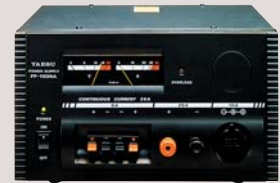
FP-1030A AC Power Supply (30 A)

About this brochure: we have made this brochure as comprehensive and factual as possible. We reserve the right, however, to make changes at any time in equipment, optional accessories, specifications, model numbers, and availability. Precise frequency range may be different in some countries. Some accessories shown herein may not be available in some countries. Some information may have been updated since the time of printing; please check with your Authorized Yaesu Dealer for complete details.