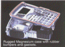
Rugged Magnesium case with rubber bumpers and gaskets.

The unmatched ruggedness of the VXA-700 is coupled with ultra-light weight, thanks to the die-cast magnesium case and chassis construction. Rubber bumpers on the bottom corners of the case protect it against damage from every-day bumps and scrapes.