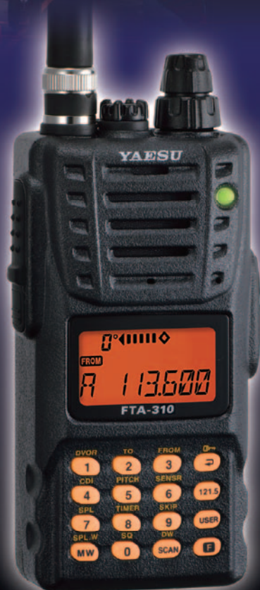
Pilot Series FTA-310