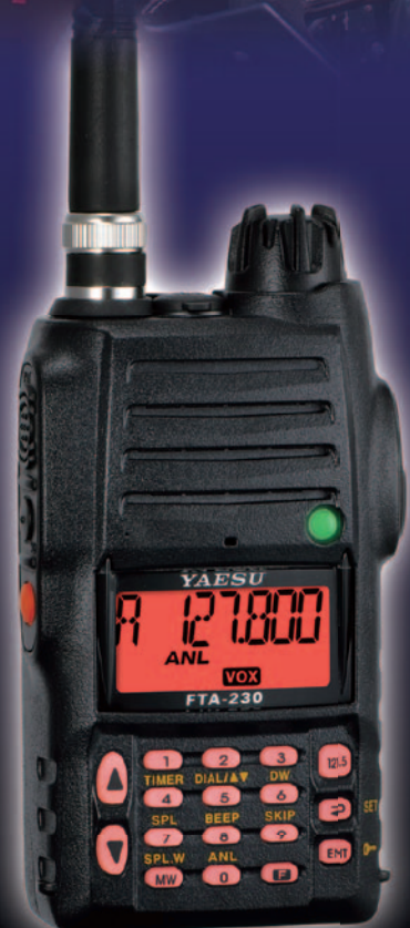
Pro Series FTA-230