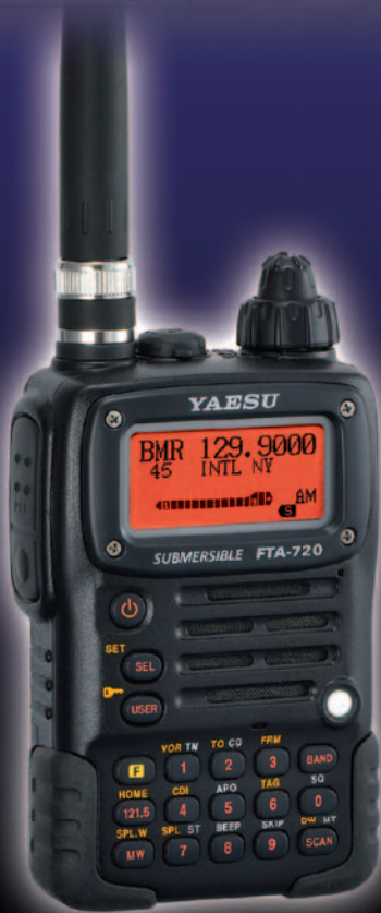
SPIRIT Series FTA-720