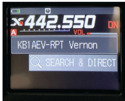
Figure 2 — Accessing the Yaesu WIREX network through the KB1AEV Fusion repeater.