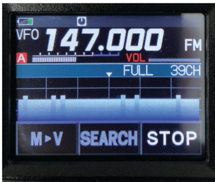
Figure 1 — The FT5DR's band scope in action.