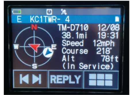
Figure 3 — Watching local APRS activity on the FT5DR's colorful LCD screen.

you briefly press the PMG button again and the FT5DR will display activity on all three frequencies in the form of vertical bars labeled P1 , P2 , and P3 (you can register up to five frequencies). Whenever activity takes place, the bars change color and expand in height. Tap on any of the bars and you're instantly transported to that frequency.