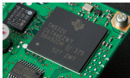
32-bit High Speed Floating Point DSP

The 32 bit high speed floating Point DSP (max 3000 MIPS) provides effective cancellation/reduction (DNR) of the random noise that is frequently frustrating in the HF frequencies. Also: the AUTO NOTCH (DNF) automatically eliminates the dominant beat tone. The CONTOUR, and the APF, are very effective receiver noise reduction tools in the HF bands operations. The YAESU original DSP QRM and noise reduction functions are provided.